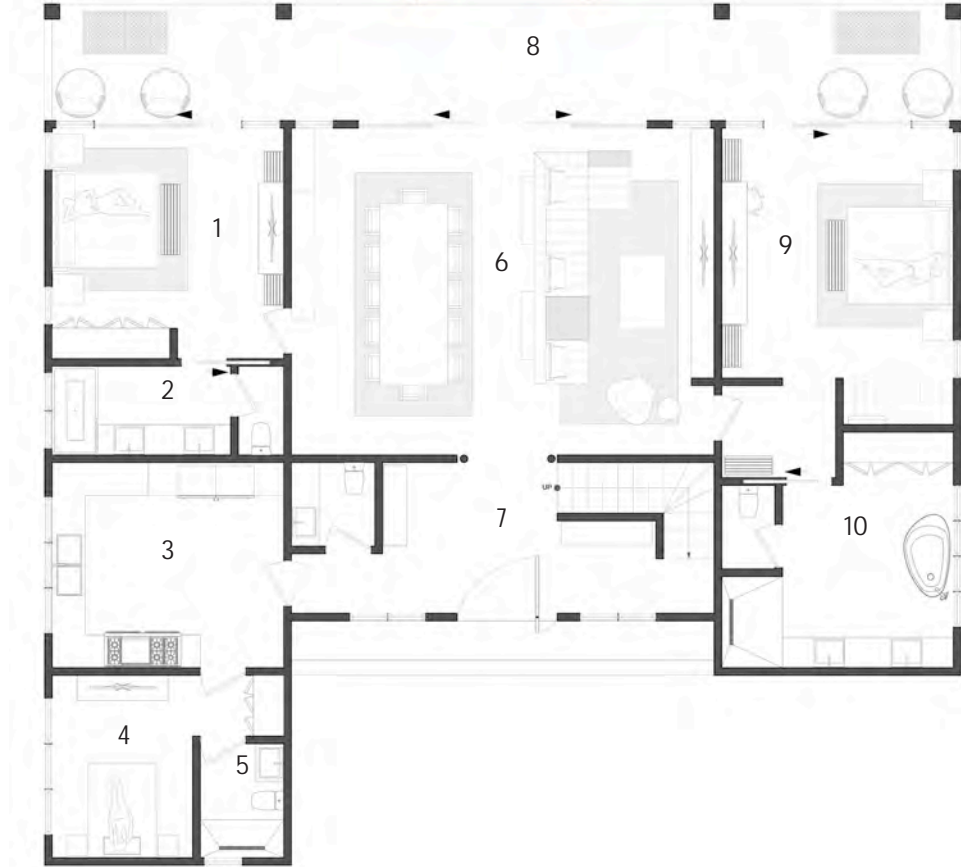
GROUND FLOOR PLAN VILLAS